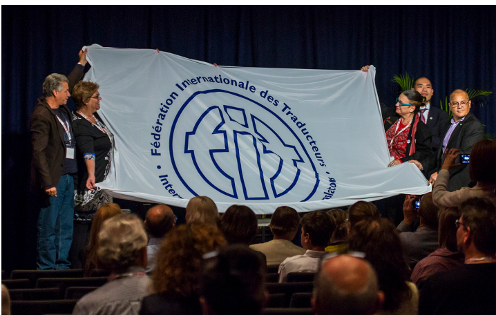
The Cuban delegation received the FIT flag

Congress participants will find in Varadero affordable All-Inclusive Resorts in an ideal climate at the end of November.