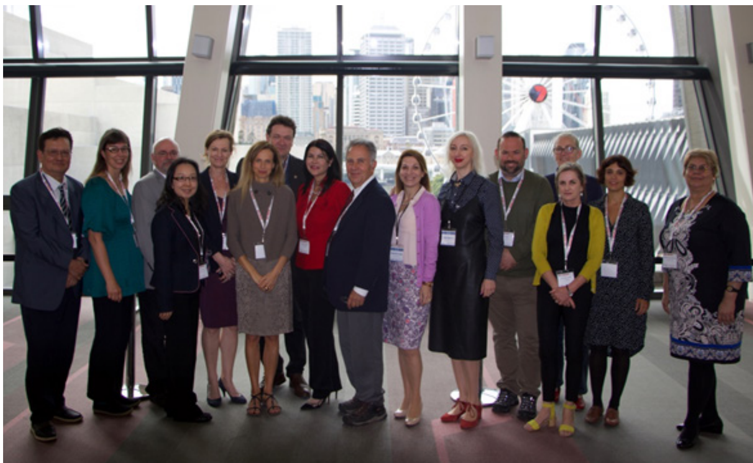
The members of the 2017 – 2020 FIT Council