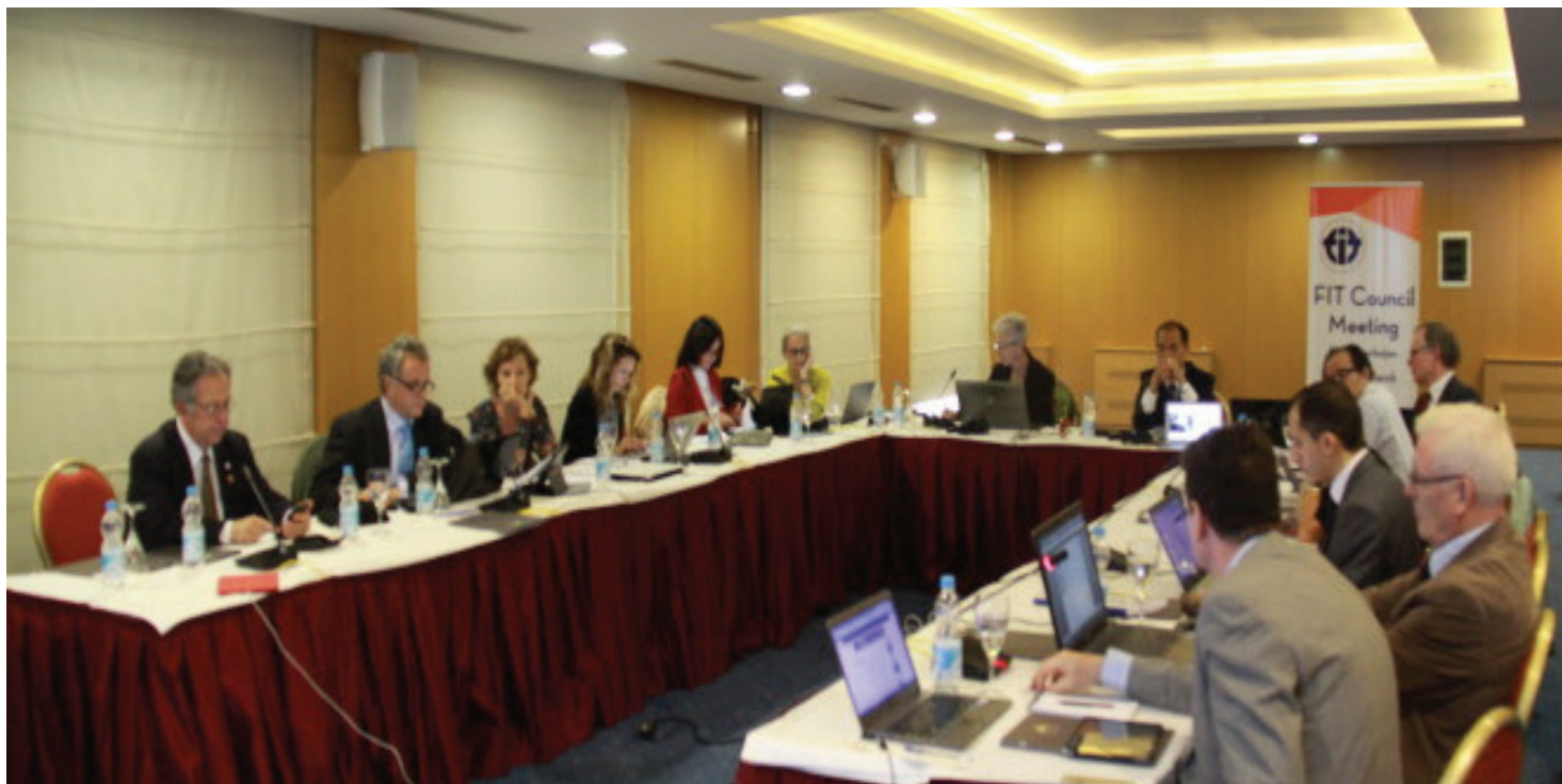
Participants at the FIT Council Meeting in Baku

and the National Association of Judiciary Interpreters and Translators (NAJIT).